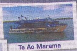
Te Ao Marama