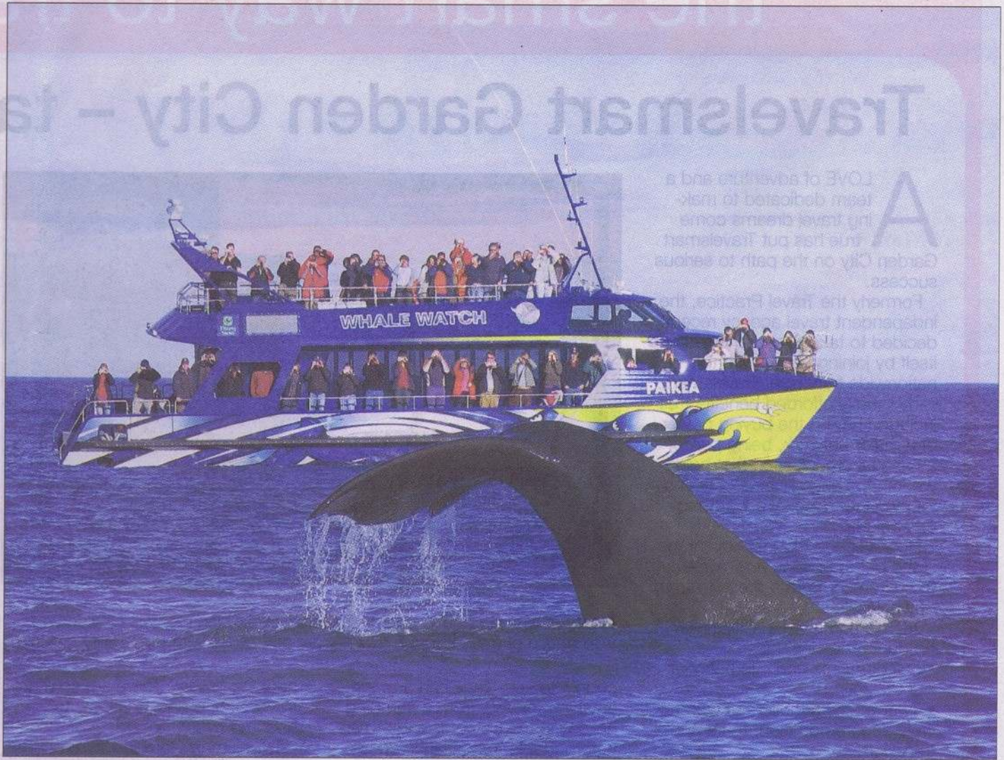
The tail of a giant sperm whale. Whale Watch Kaikoura provides the thrill of an up close encounter.